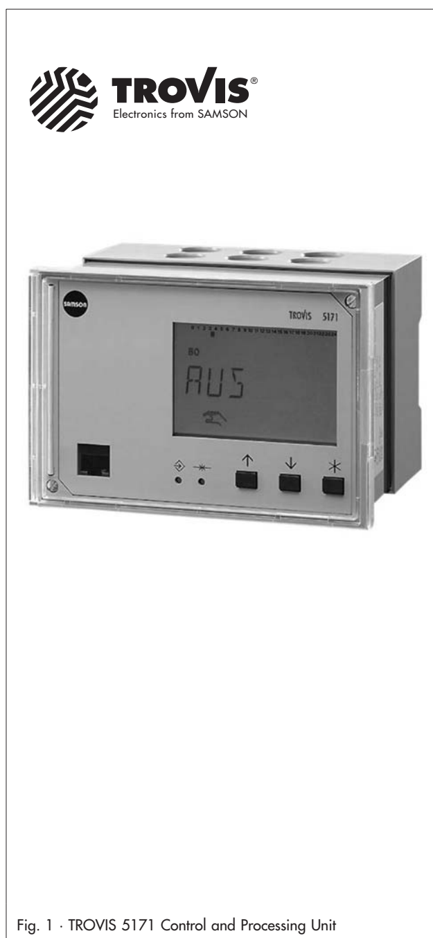
Fig. 1 · TROVIS 5171 Control and Processing Unit